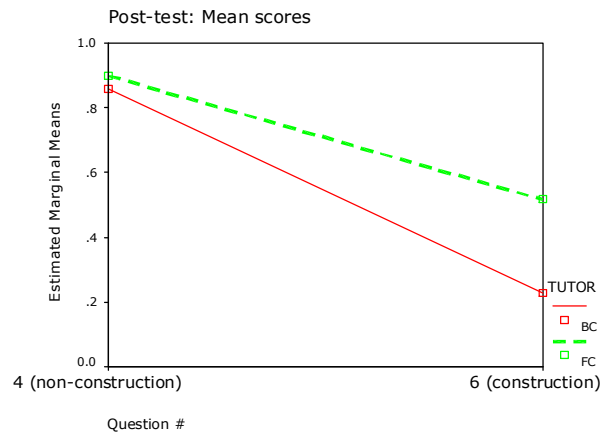
Figure 2: Mean scores on proof-writing problems in the post-test with and without construction

Analysis of how students wrote proofs revealed a significant difference in the use of prem-